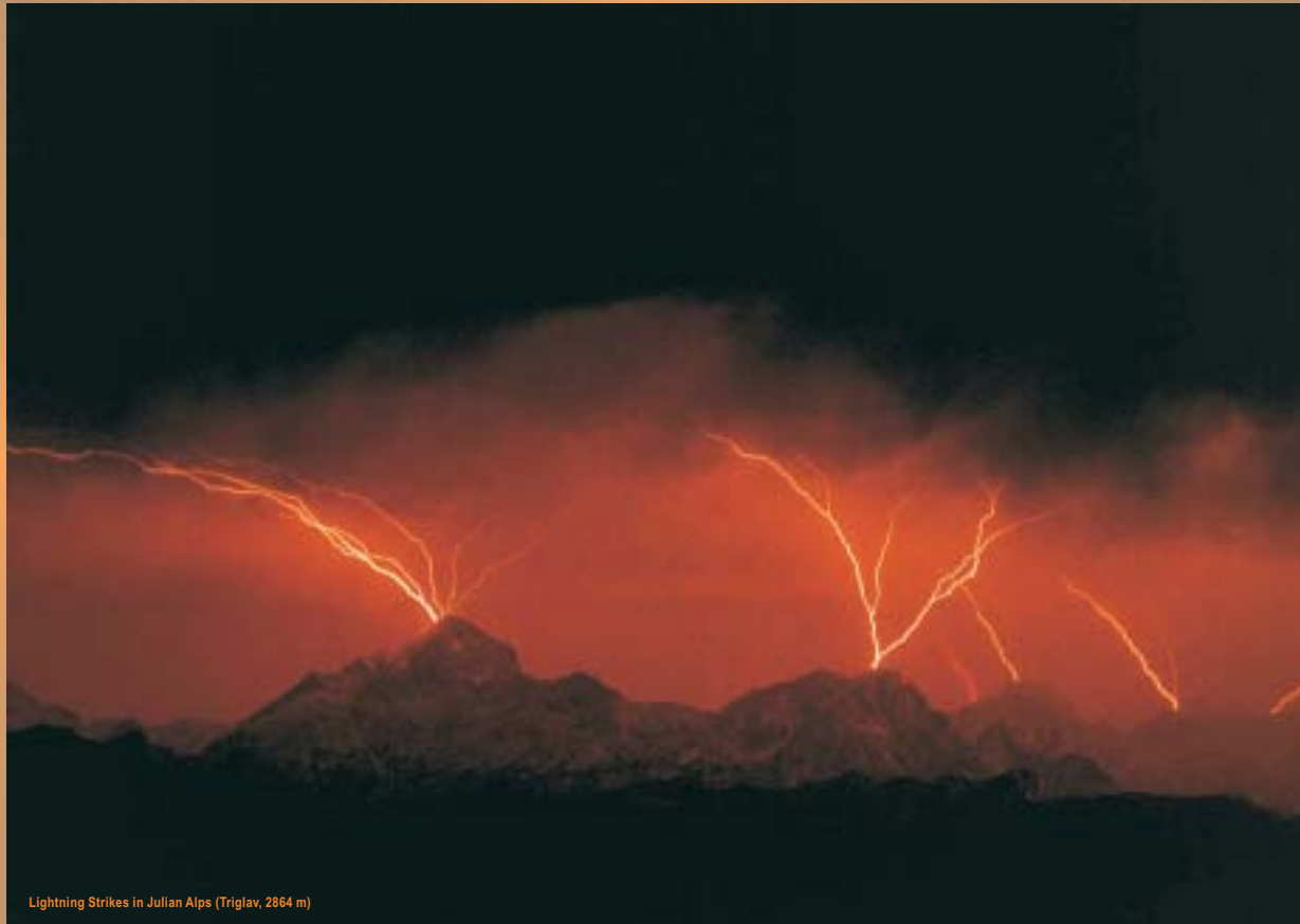
Lightning Strikes in Julian Alps (Triglav, 2864 m)