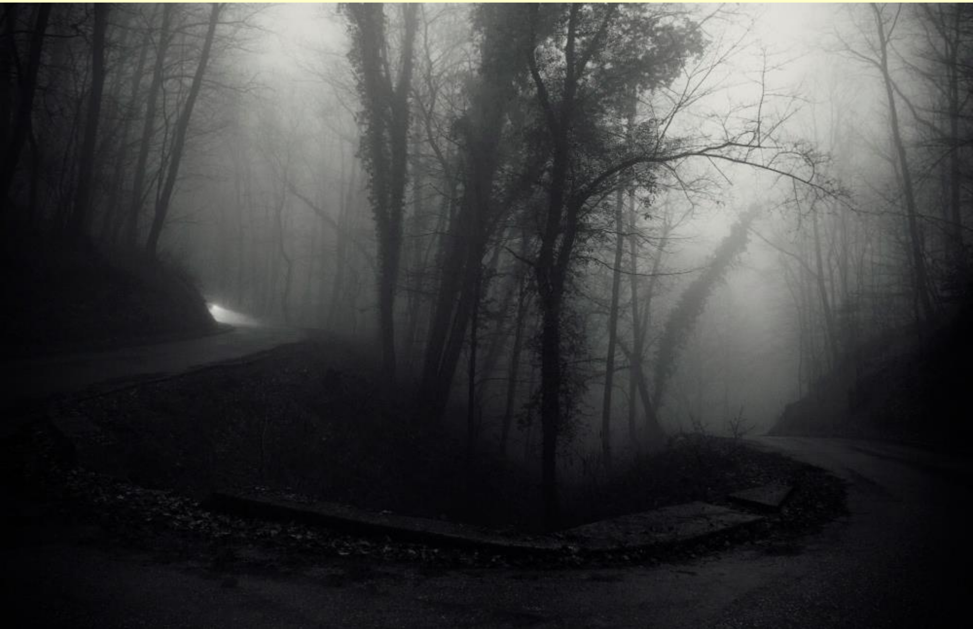
Driving along a misty road at night