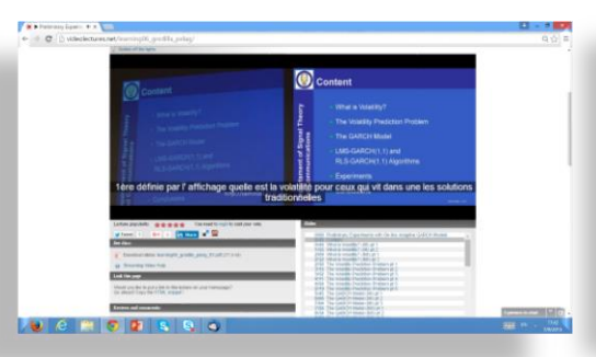
Content quality assurance