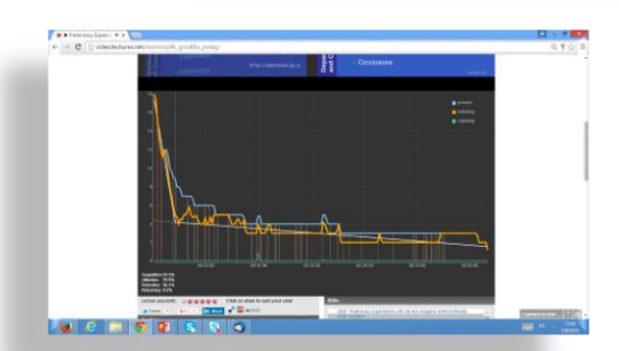
User modeling and learning analytics

Aritifical Intelligence Technologies can solve many of the current problems we are facing today in streamlining the creation and use of OER and Open Education.