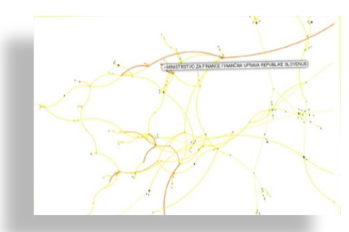
Transparent and robust learning processes