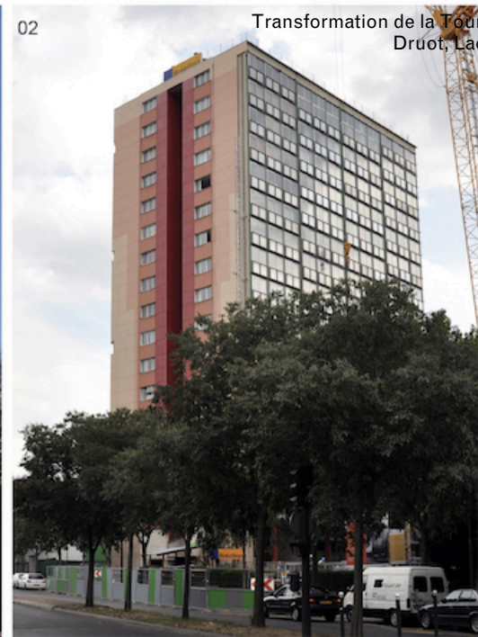
Transformation de la Tour Bois le Prêtre Druot, Lacaton & Vassal Paris, 2011