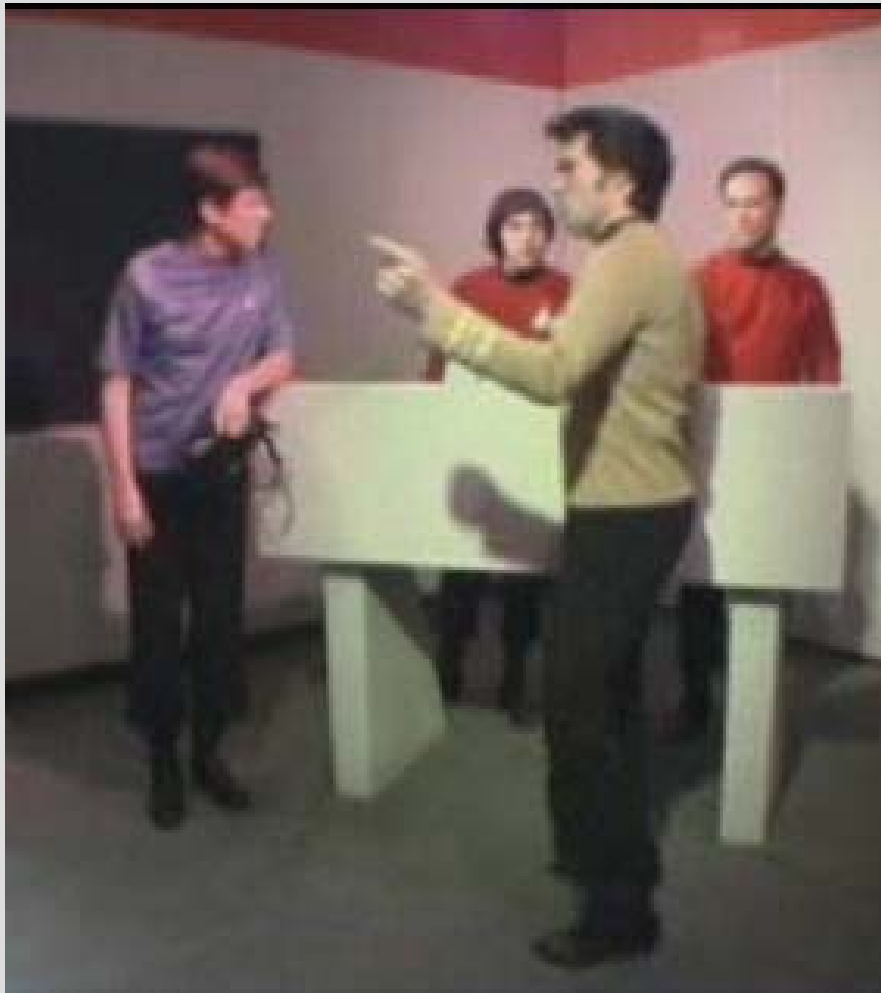
Come What May (pilot)