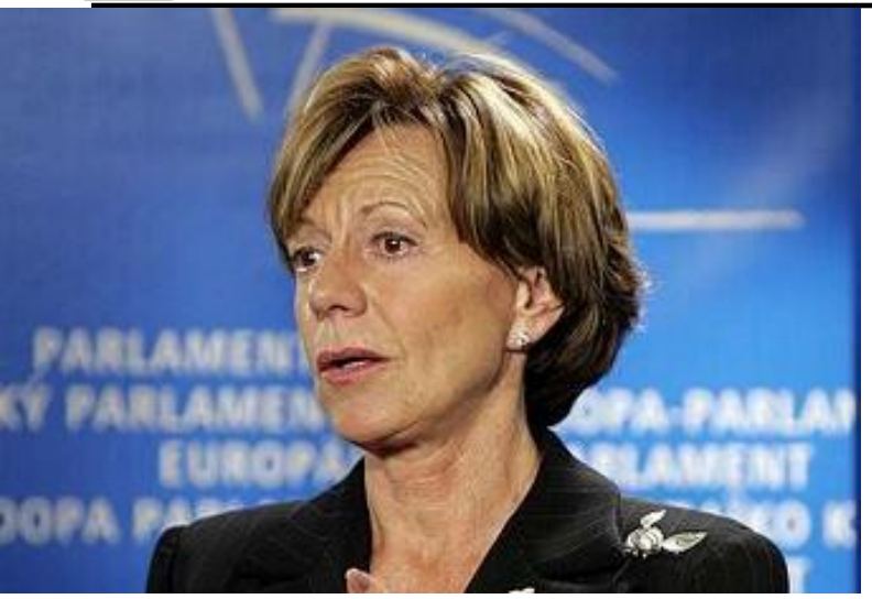
Neelie KROES, Commissioner for the Digital Agenda (2010): Economic Growth in EUROPE (Maastricht, The Netherlands, March 12° 2010)

Digital Agenda will consist of 7 key themes, which will have an impact on your daily life – both as businesspeople and as citizens: