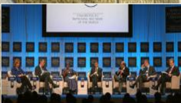
Focusing on food security Setting the agenda at WEF 2012»