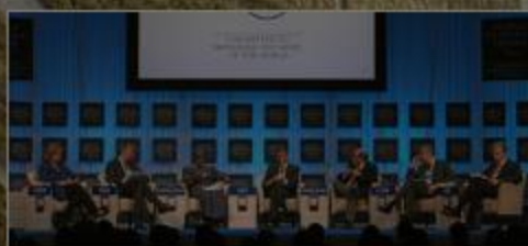
Focusing on food security Setting the agenda at WEF 2012»