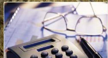
sigma 1/2012 Profitability in life insurance»