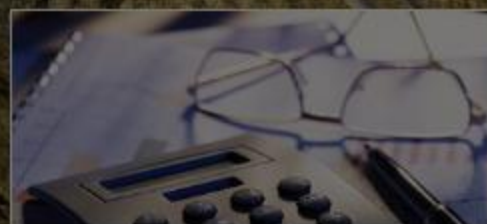
sigma 1/2012 Profitability in life insurance»

| sigma | Admin Re® | Client training | Financial information | Corporate governance | Insurance-Linked Securities | Solvency II