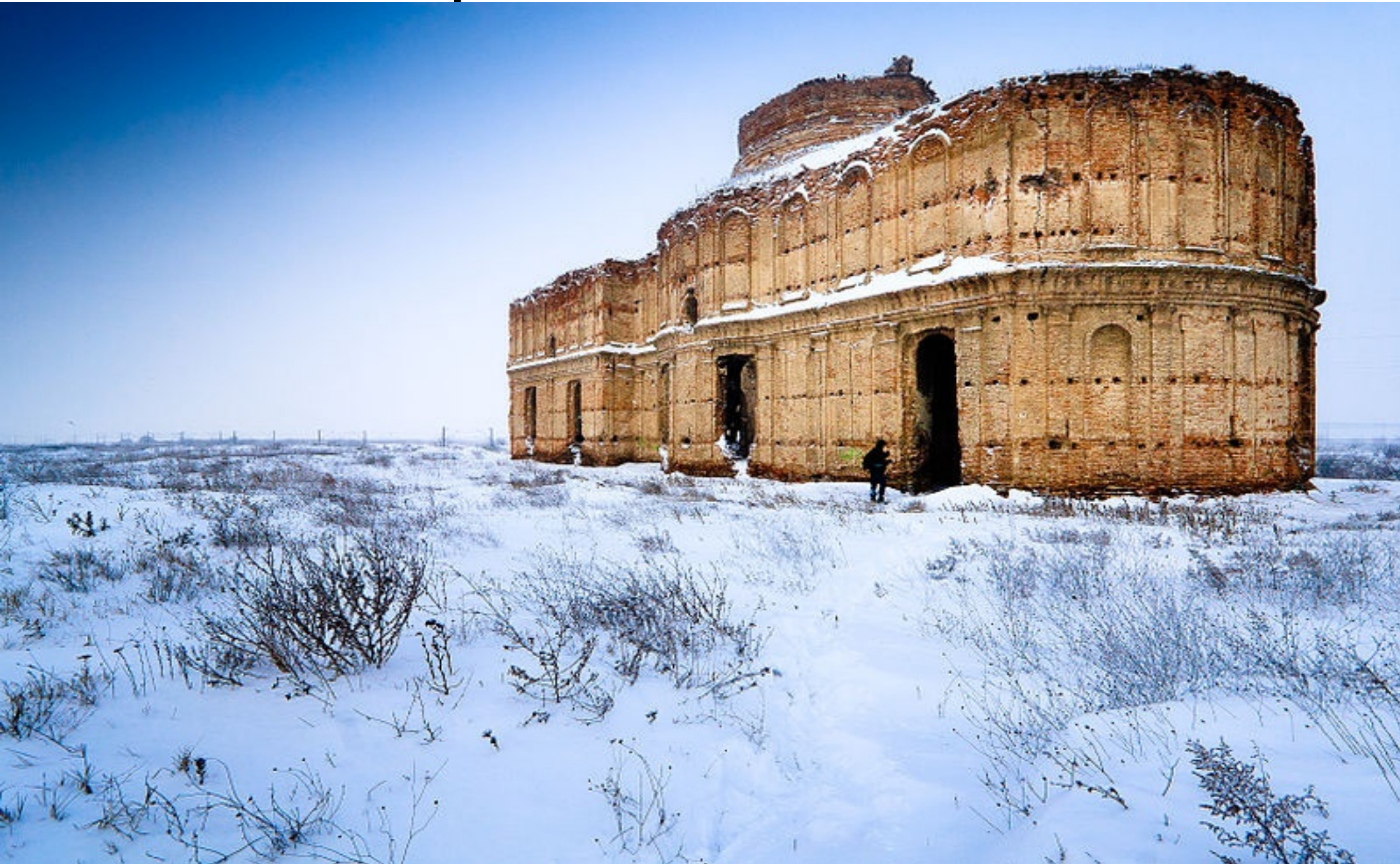
WLM 2011: Chaijna Monastery, Bucharest. (1 of 165,000)