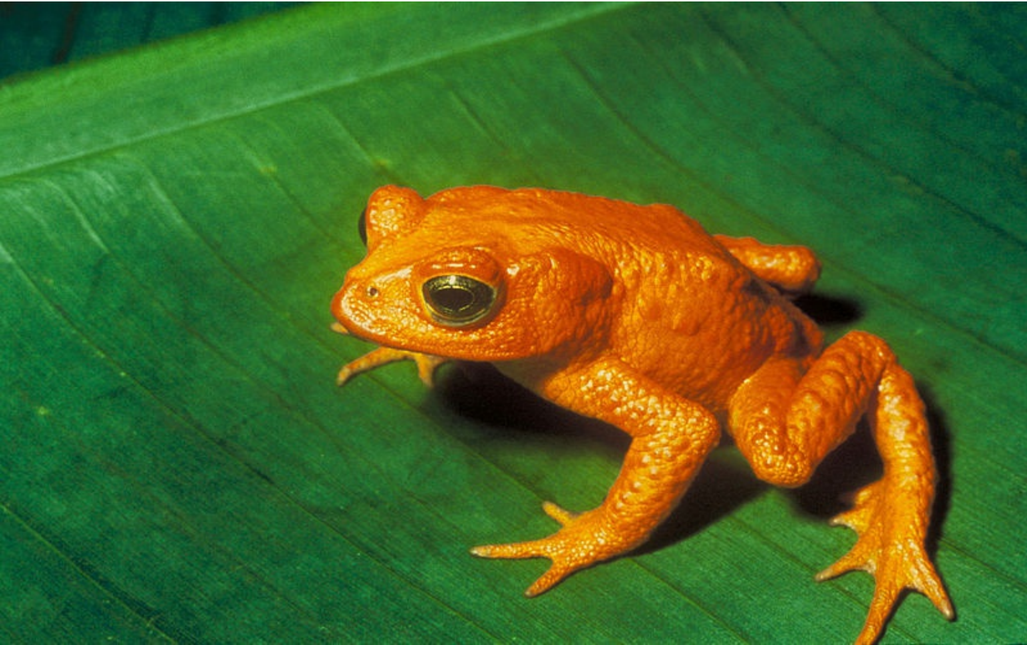
Golden toad, extinct (1989)