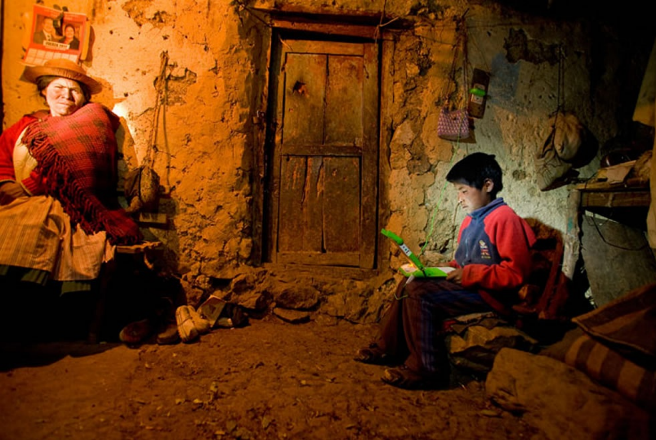
Reading Wikipedia offline. Arahuary, Peru. (2007)