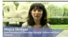
OER by Mojca Skrinjar