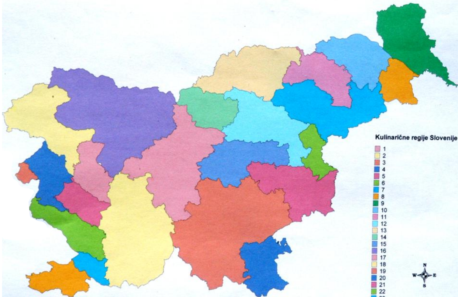
Kulinarične regije Slovenije