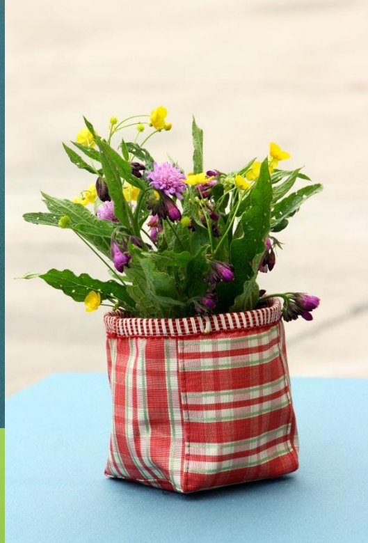
Unique handbags for medicines, jewelry, floral pots...