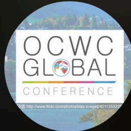
OCW14 Consortium Global Conference LJUBLJANA, SLOVENIA 23 - 25 April 2014