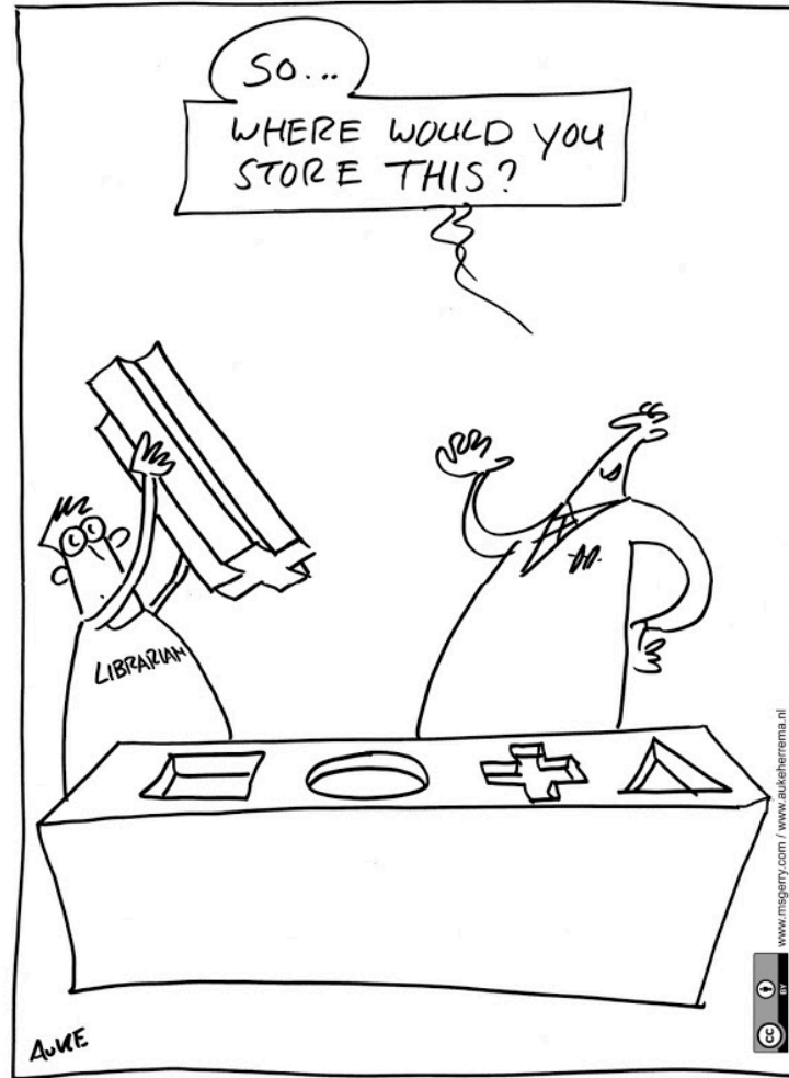
LEARNING HOW TO ARCHIVE DATA